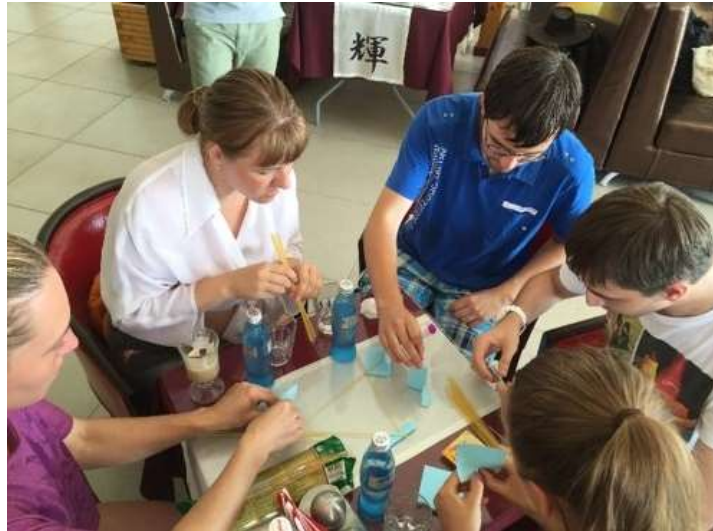
Fig. 3 Design Thinking Jam

Ideation is a step which focuses on the idea of generation in terms of concepts and outcomes [11]. The aim of ideation is to explore a wide solution space – both a large quantity of ideas and diversity among those ideas [7]. Moreover, it is important to follow the brainstorming rules [1]: