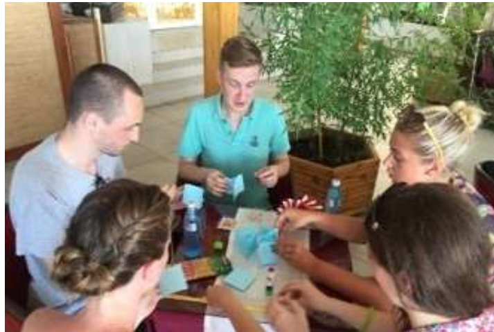
Fig. 1 Design Thinking Jam

collaborate and co-innovate with domain experts, generate creative ideas and develop concepts and prototypes of solutions in order to respond to real-world, user-centered design problem [3]. Such a non-trivial approach to problem-solving process enables to get not only an effective result but also to obtain a lot of advantages for both business and academia. For instance, companies have an opportunity to apply new prototyping technologies, leverage student talent for recruiting needs and develop company's HR-brand. As for universities, there is a chance for scholars to develop design and communication and project-management skills, get exposure of real-world design problems and showcase competencies to potential employers.