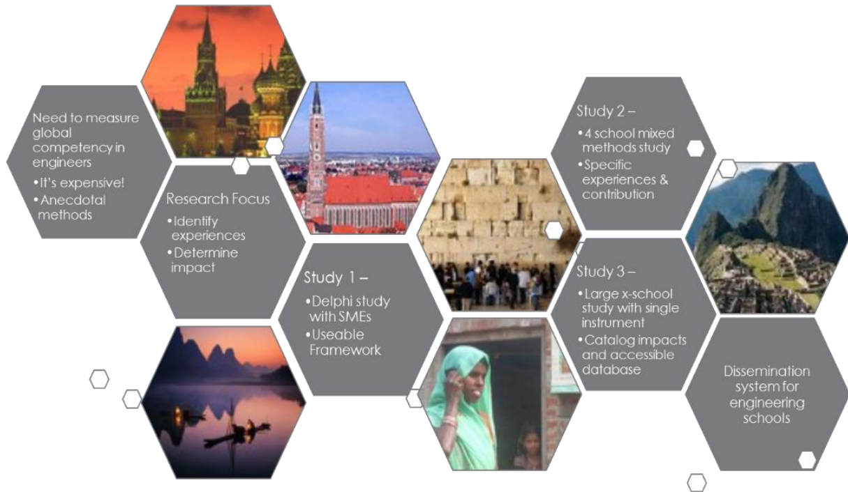
Figure 1. Overview of the Research Agenda

contextual knowledge, personal and professional qualities, and cross-cultural communication skills and strategies. The outcomes from this study were used to produce a model of global engineering preparedness, which helped to provide the basis for a student background instrument that was employed in Study Two, as well as provided a means to determine how certain outcomes were achieved from students' international and global experiences.