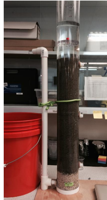
Figure 1. Bench-scale model IBSF.

In the second stage, samples taken using this apparatus will be used to infer the profiles of dissolved oxygen and bacteriological populations as functions of depth and time. Also, as part of the research objectives a short survey will be conducted to the IBSF users in Duchity. The broader goal is to use the newly discovered scientific knowledge to identify future improvements to the filter design in order to address the users’ needs, particularly to optimize the materials used and the functioning of the IBSF in order to shorten the preparation time of the filter (IBSF currently must be flushed for approximately 15 to 30 days prior to use).