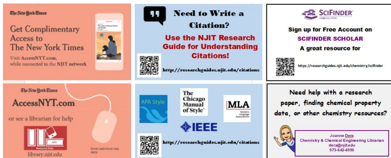
Figure 2: Double-Sided Promotional Tickets

Set-up: At each individual site, we either used an existing table at the location or brought along a folded card table, tablecloth, the tri-fold poster board with marketing materials, the promotional tickets, candy, and a laptop for on-the-spot reference questions. The candy usually enticed students to stop by and talk with us.