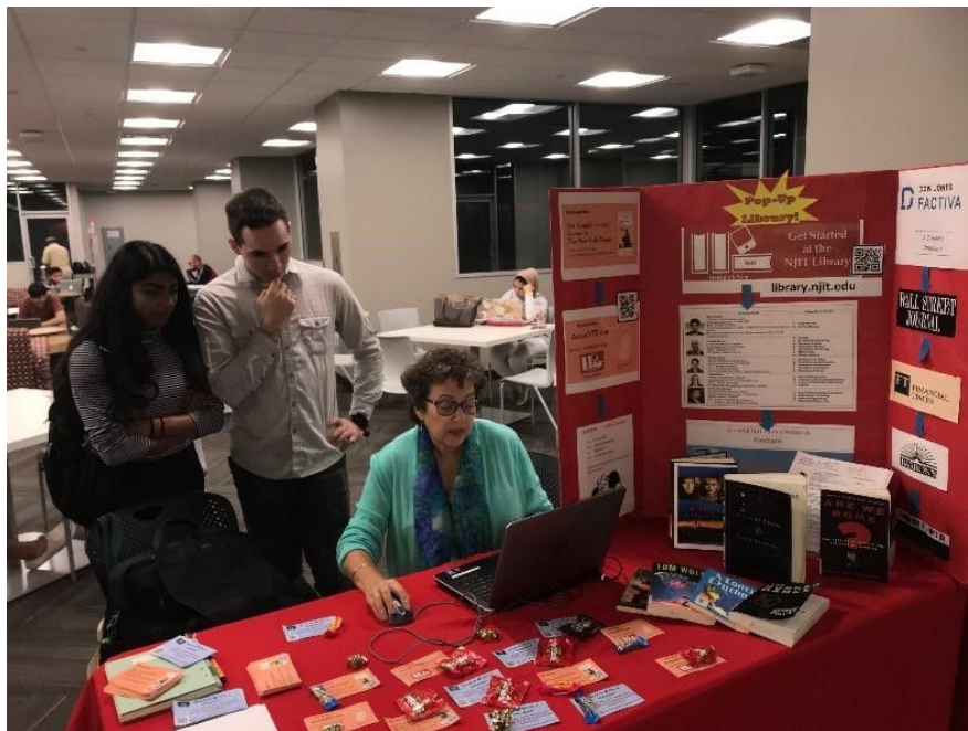
Figure 3: Pop-up in Action

At pop-ups that we used the direct approach, actively interacting with students, we recorded any meaningful conversations using the laptop that we brought to each pop-up. We would record the type of conversation, such as, answering a reference question, discussing future collaboration with a faculty member, showing a student or faculty member an electronic resource, etc.