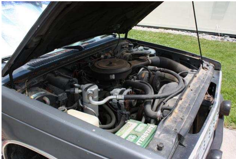
Figure 1: The Manual Chevy S-10pPickup

We calculated the power required to reach a number of different top speeds as well as the range associated with them based on the weight of the truck, weight of the proposed electrical components, dimensions, and the desired range.