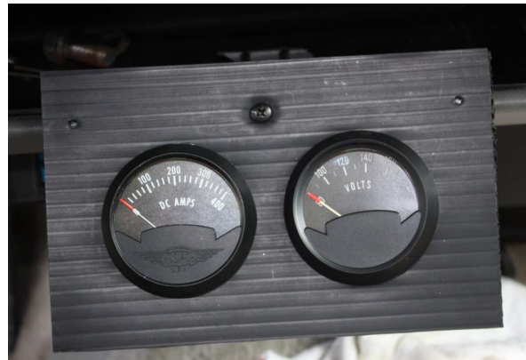
Figure 9: Voltmeter and Ammeter Gauges

Two new instruments, a voltmeter gauge and an ammeter gauge, as shown in figure 9 were installed in the truck. The voltmeter effectively serves as the gas gauge showing the voltage level of the battery bank. The ammeter shows the amount of current drawn from the batteries. It provides an indication of how quickly the batteries are being drained.