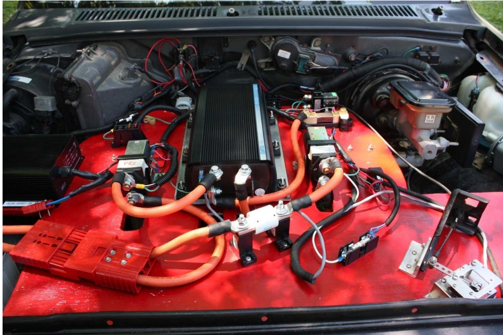
Figure 8: Controller and its circuits

Two new instruments, a voltmeter gauge and an ammeter gauge, as shown in figure 9 were installed in the truck. The voltmeter effectively serves as the gas gauge showing the voltage level of the battery bank. The ammeter shows the amount of current drawn from the batteries. It provides an indication of how quickly the batteries are being drained.