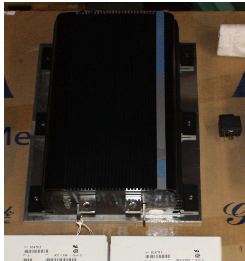
Figure 4: Curtis Controller

The selected controller was the 1231C-8601 Curtis Controller as shown in figure 4. This controller was selected because it can handle our desired 144-V DC. It has a 500-amp max and uses the selected 0-5kohm potentiometer. It is also a fairly well known and widely used model that ensures proper value and electric vehicle support.