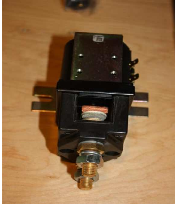
Figure 5: Contactor Used in the Design

The DC charger selected is a "smart" charger that is designed to extend the batteries life by using pre-programmed algorithms to control the charging rate. It can also accept both 110-V AC and 220-V AC that make it quite versatile.