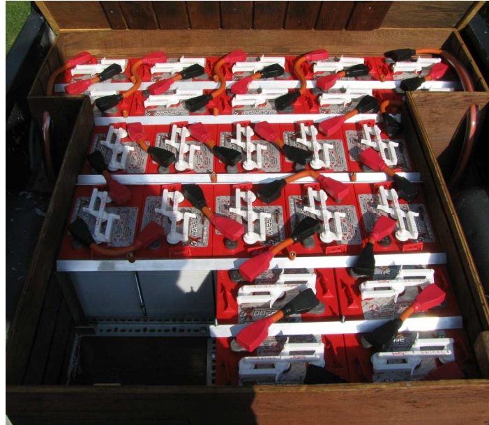
Figure 10: The Battery Compartment

The battery box in the bed was connected to contactors on the controller board by two wires. These two wires serve as the only connection between the batteries and the motor controller. The controller board's 144-V connections were completed by using the 2/0 gauge wire.