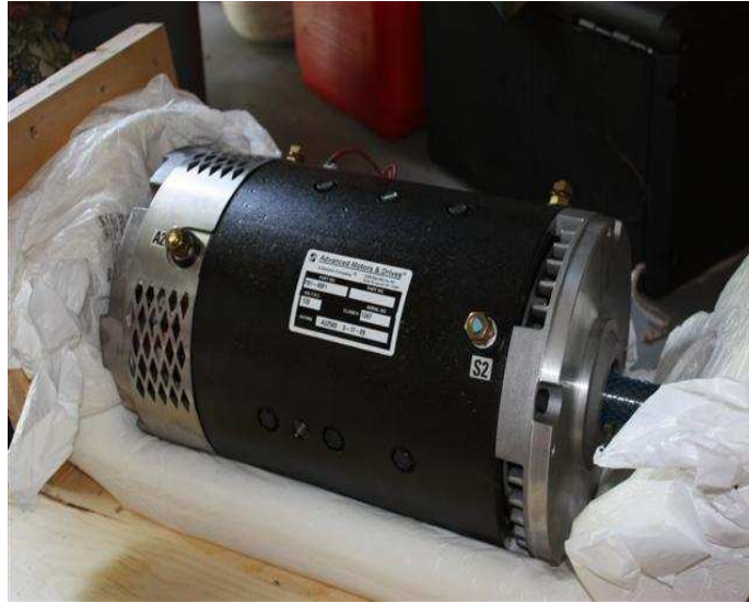
Figure 3: Advanced DC Electric Motor

The selected controller was the 1231C-8601 Curtis Controller as shown in figure 4. This controller was selected because it can handle our desired 144-V DC. It has a 500-amp max and uses the selected 0-5kohm potentiometer. It is also a fairly well known and widely used model that ensures proper value and electric vehicle support.