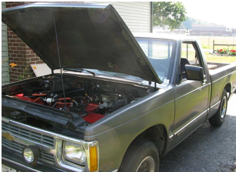
Figure 11: The Designed Electric Truck

The DC charger needed to charge the 144-V battery bank was installed under the truck's hood below the controller board. This gives it plenty of ventilation to prevent overheating. The final assembly is shown in figure 11.