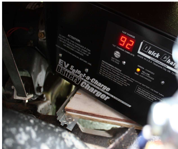
Figure 6: The DC Charger

The DC charger selected is a "smart" charger that is designed to extend the batteries life by using pre-programmed algorithms to control the charging rate. It can also accept both 110-V AC and 220-V AC that make it quite versatile.