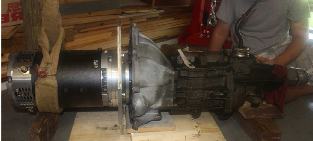
Figure 7: Electric Motor-Transmission Assembly

using a manufactured aluminum adapter plate as shown in figure 7. The 1/2 inch aluminum plate provides plenty of strength and a good and strong connection. The new electric motor-transmission assembly was reinstalled along with the drive shaft and everything was securely attached to the truck's frame.