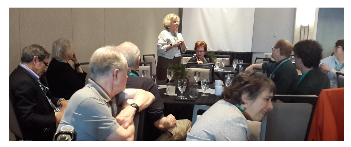
Scenes / Fellow Breakfast Introductions – June 26, 2019: