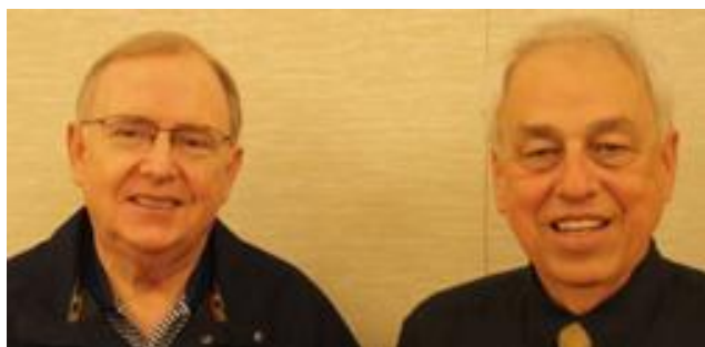
ASEE Award Recipients