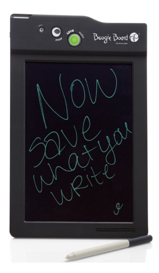
Figure 1. Picture of Boogie Board Rip TM LCD Tablet and Stylus<sup>[2]</sup>

need only focus on the tablet because the visual feedback from the tablet is much like a pen and paper. This is much more intuitive than, for example, a Smart Board <sup>TM</sup>. Noted also, of course, the tablet is much more affordable and sustainable from a hardware and software support point of view. Note Figure 1 for a picture of the device.